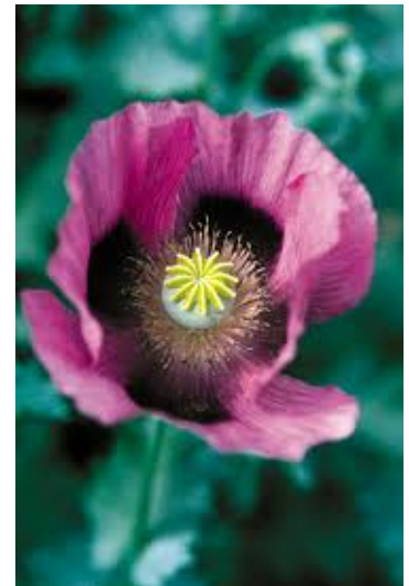
Opium (Papaver somniferum)