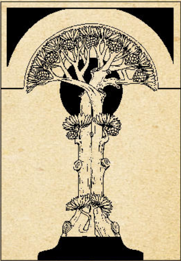
Centre for Integrative Medical Training 2021 Provided on licence to registered students of Homeopathy Property of CIMT. All rights reserved.

Discussion or disclosure is not permitted, except within your training group.